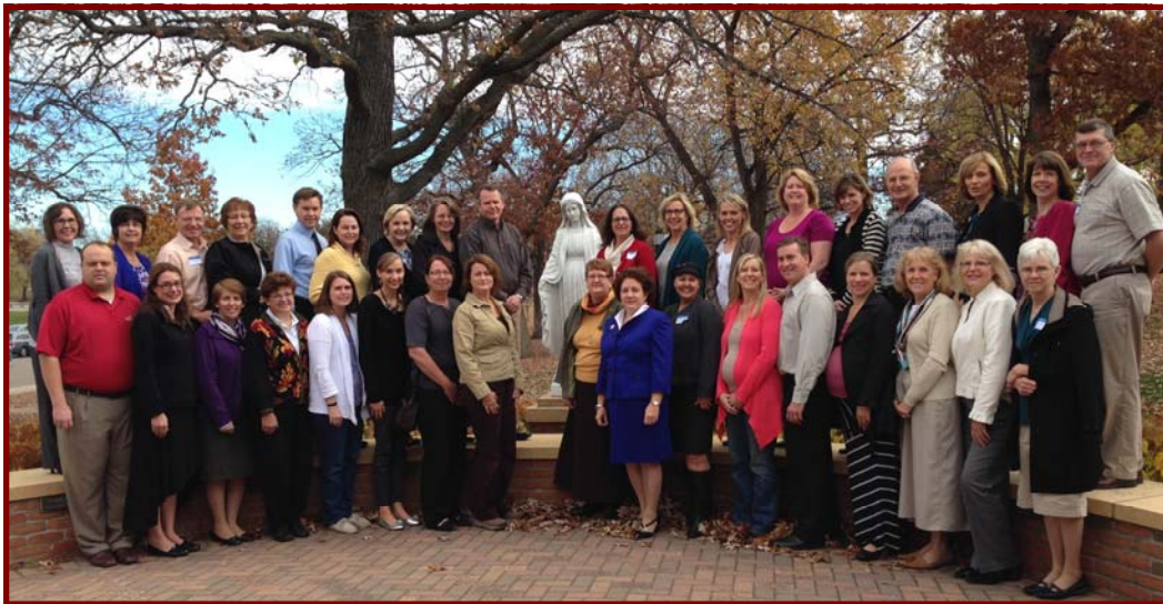
Above: "Family Photo" taken at the Renewal kick-off convention in October at Our Lady of Grace in Edina.