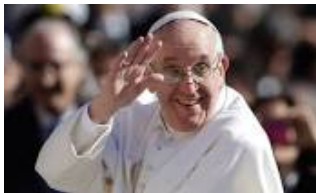
Pope Francis' Prayer Intentions October 2014

The men's team will meet at Ave Maria Academy in Maple Grove. The team meetings will take place in October through May, two evenings a month for 90 minutes. Fathers are the protectors and leaders of families, and this study will be a gift to men. Please see the attached flyer for more information.